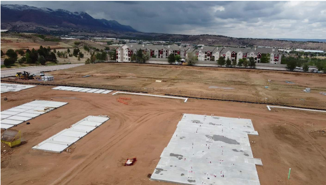
West End of Project Viewing Northwest