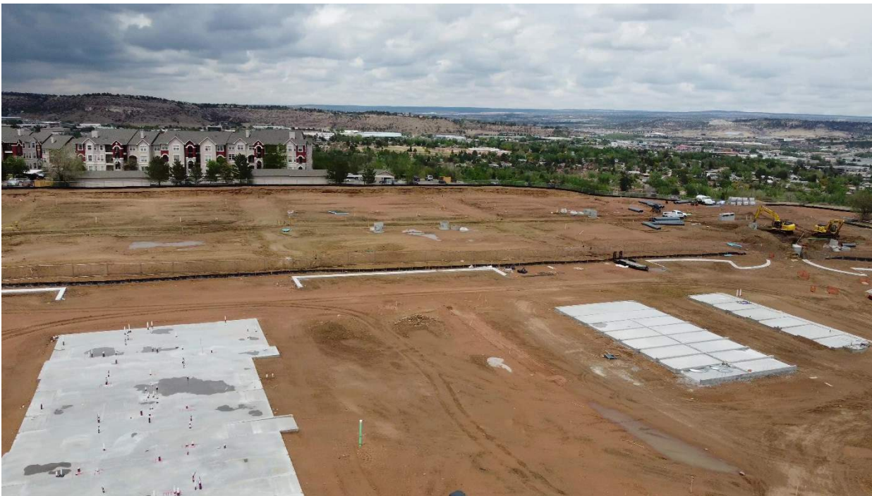
East End of Project Viewing Northeast